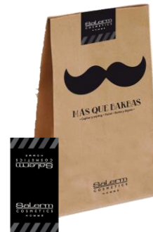
Paper bag (148x210mm) Ref: 5845