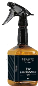
Water spray Ref: 5846

Spanish – English : 5839 Spanish – Portuguese : 5838 Spanish – Italian : 5837 Spanish – Russian : 5834 Spanish – Czech : 5836