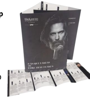
Homme range pamphlet

Spanish : 5847 English : 5841 Italian : 5842 Portuguese : 5840 Russian : 5835