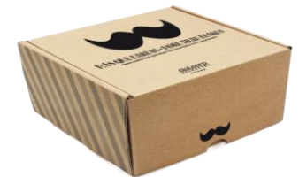
Father's Day Pack Claim "More than beards" Spanish / English Ref: 4723

Spanish (VPTHEs) English (VPTHI) Italian (VPTHIT) Portuguese (VPTHP)