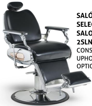
SALÓN SELECCIÓN SALON CHAIR 2SLNEWYORK CONSULT UPHOLSTERY OPTIONS