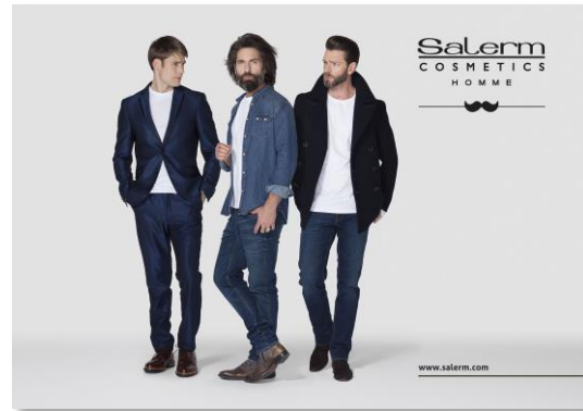
Poster (100x70cm) Ref.: 5843