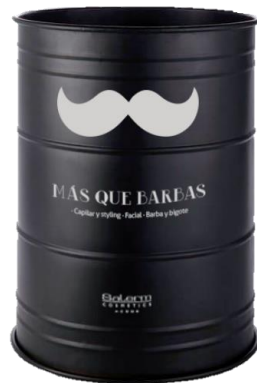
Display barrel Ref: 5830